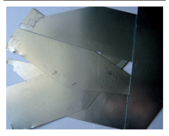
Fig. 1. Galvanized steel scrap

possibility of weakening of the lining of melting furnace and increased risk of melt leakage connected with the consequences of active physico-chemical interaction of zinc with refractories;