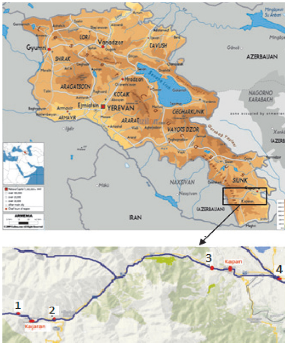
Fig. 1. The location of the River Voghji with points in which the sampling of water (points 1, 2, 3, 4), and the study of migration of heavy metals by bank of the river (point 3) have taken place

As an object for monitoring, the River near the town of Kapan, Armenia has been selected (Fig. 1). The River Voghji is the left tributary of the River Araks. The river length on the territory of Armenia is 48 km and the water catchment area – 933 km 2 , with 0,038% of average inclination and 2200 m of average catchment area elevation.